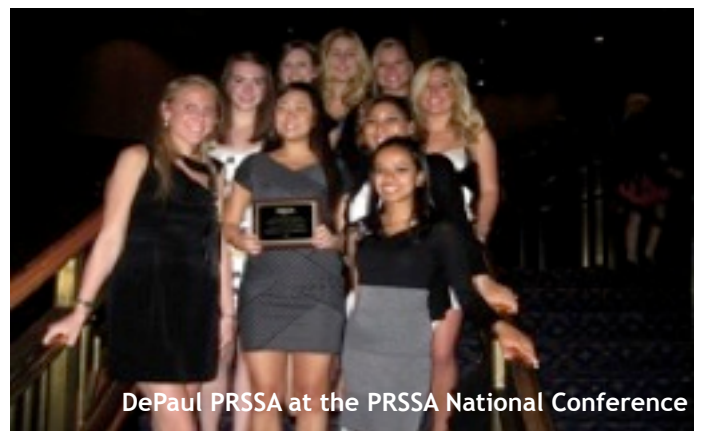
DePaul PRSSA at the PRSSA National Conference