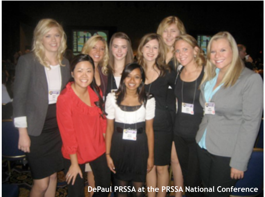
DePaul PRSSA at the PRSSA National Conference