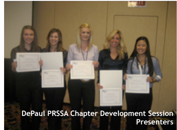
DePaul PRSSA Chapter Development Session Presenters