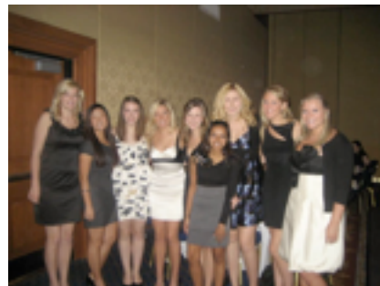
DePaul PRSSA at the PRSSA National Conference